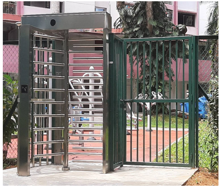
View of Gate G from inside the school compound